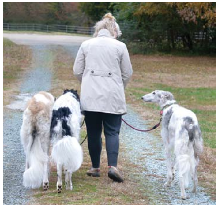
The existing pack (left) is kept separate from the new pack member (right)

Walking together as a form of introduction will communicate the structure of the pack and foster acceptance while minimizing misunderstandings and confrontation. This is a positive method to start a long and happy relationship.